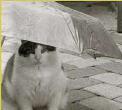
Jan. 2010 Waiting for breakfast and prepared for rain.